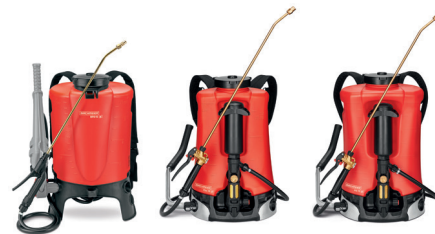
Backpack sprayers RPD 15, Flox 10, Iris 15