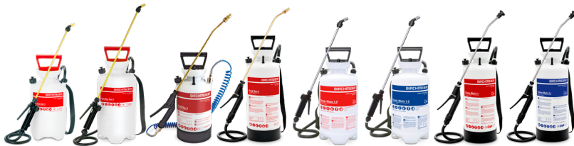
Compression sprayers Garden Star 3 / 5, Profi Star 3 / 5, Rondo-Matic 5 P / 5 E, Clean-Matic 5 P / 5 E